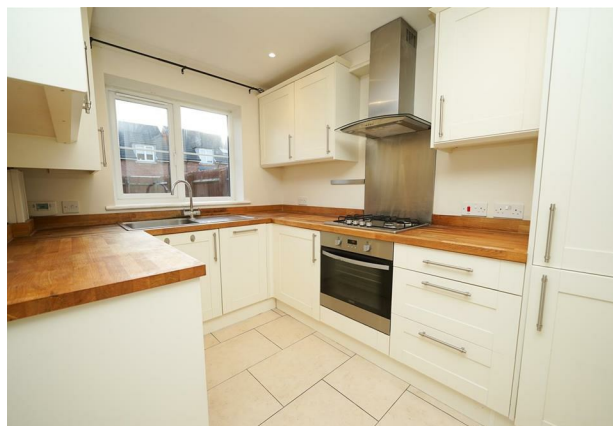
Allocated Parking for One Car